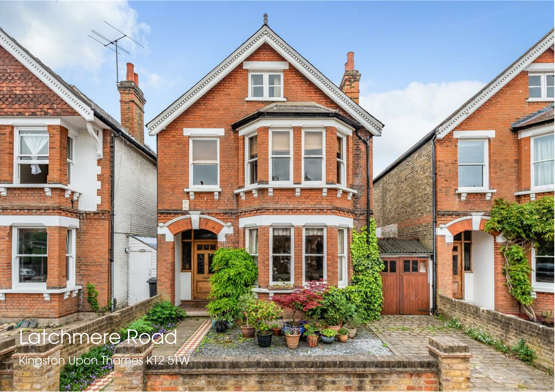
Latchmere Road Kingston Upon Thames KT2 5TW